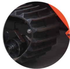
工程履带 Engineering track