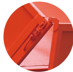
加厚车厢 Thickened compartment